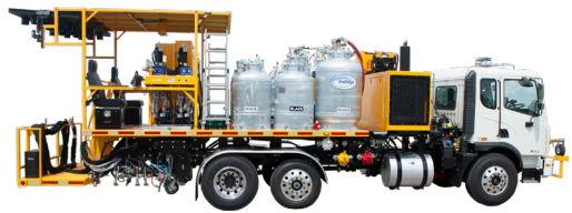
Long Line Striper